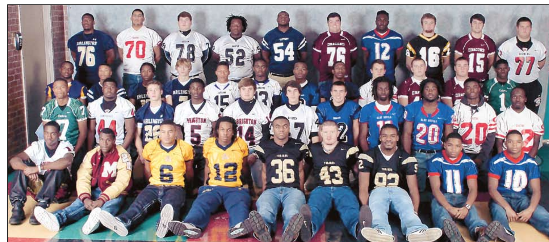
SHELBY SUBURBAN TEAM