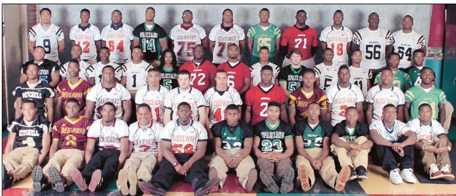
MIAA 5A-6A TEAM