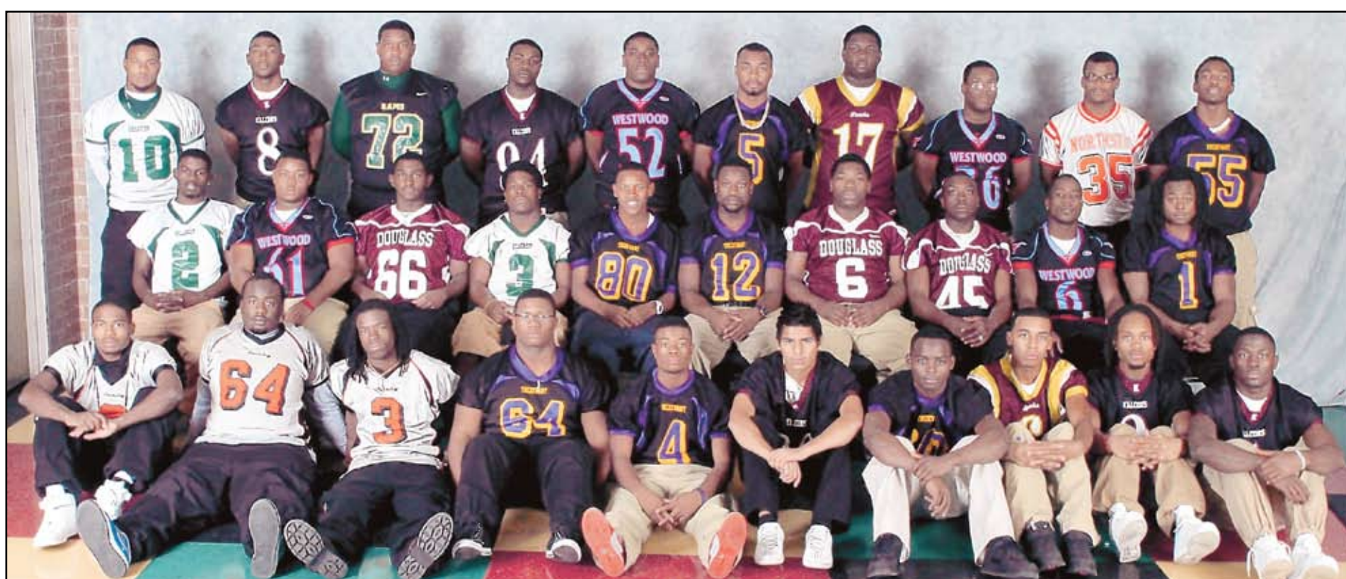
MIAA 1A-2A-3A-4A TEAM