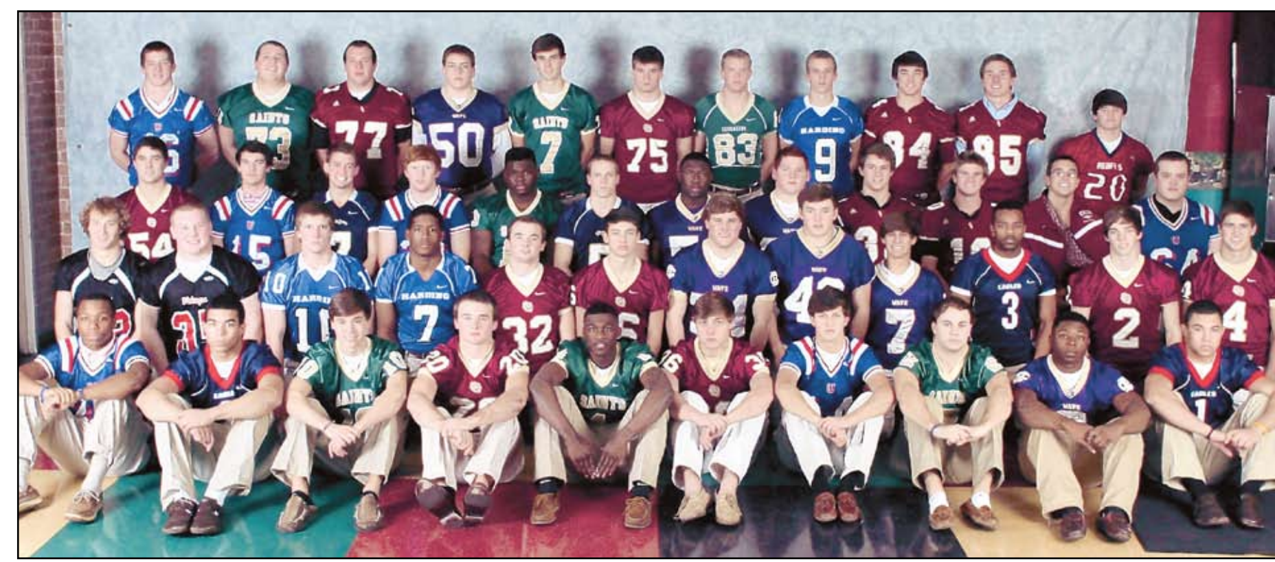
PRIVATE SCHOOLS TEAM